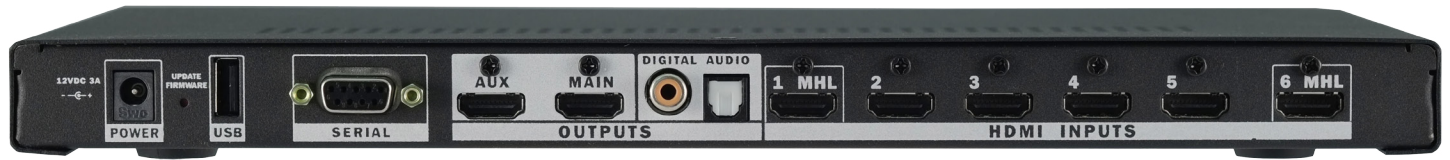
Rear Panel of the DVDO Matrix 6